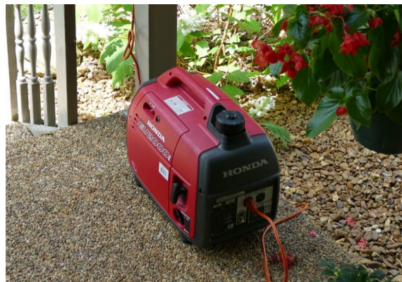
Power trip—line to 2 nd floor shack