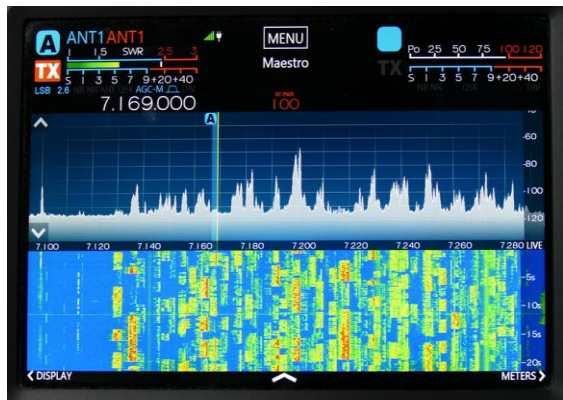
Waterfall view of 40m