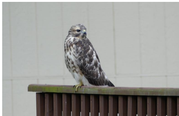
Hawk Security—keeping critters off antennas.